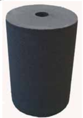
Big Active Carbon Block Filter